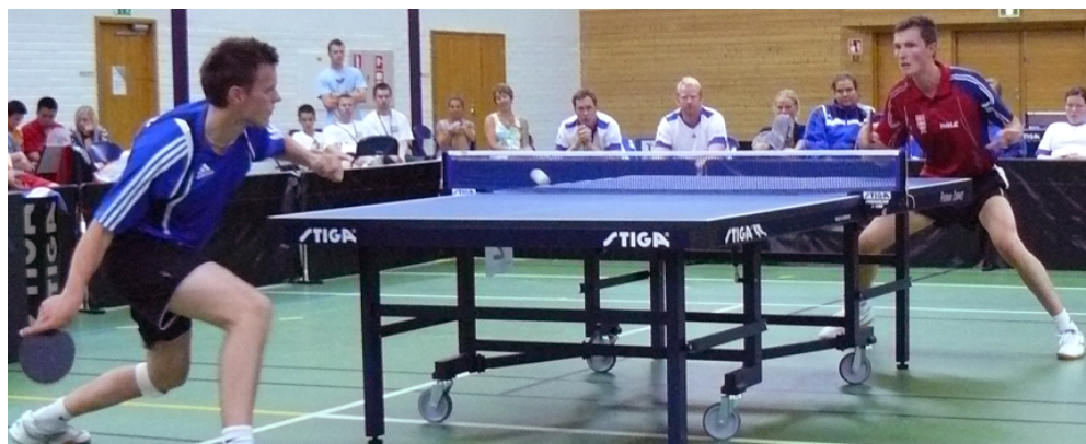
Table Tennis is becoming a far more high profile sport in Jersey ...”